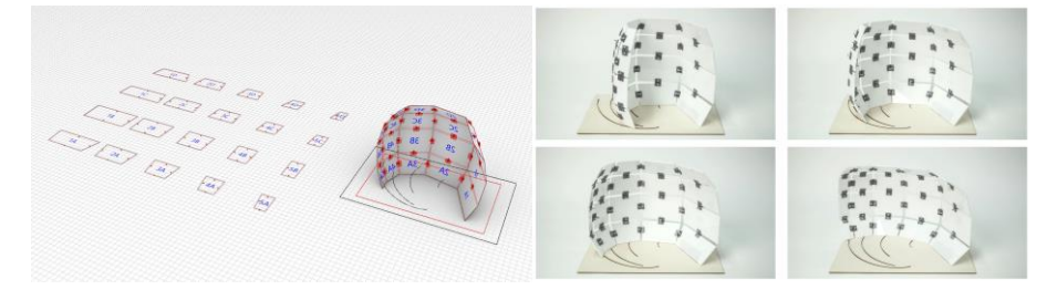
Fig. 4. (a) Drawing of extracted geometry and additional IDs ready to be laser cutted, (b) Picture of the physical model

In the next step, we used the GH definition to determine the minimum and maximum position of each hinge. For this model, the rotation angles range from 0.3° to 87.77°. Parametrically constructed hinges allowed the implementation of the boundary values as physical boundaries for each hinge. Material thickness, hinge mounting, and the diameter of the rotating part of the hinges had to match precisely, as any other position of the rotation axis would have caused the mesh to block. We designed the hinges under the constraint that the axis of rotation must be positioned exactly along the interior edges of the mesh. A total of thirty-one hinges were needed to connect all faces together as well as one large hinge to connect the first face, the lower edge of which is fixed in position. All other elements have a complex relative motion to the ground plate. We custom manufactured each hinge from grey coloured ABS filament using a 3D printer. We made the ground plate with four slits acting as guiding rails for the physical model using a laser cutter. These rails were generated by the path-curves of the midpoints of the four non-fixed edges of the trajectory polyline. We added small pivots in the form of pins to these midpoints. Note that the proposed construction takes advantage of the fact that the trajectory polyline remains planar during the deformation.